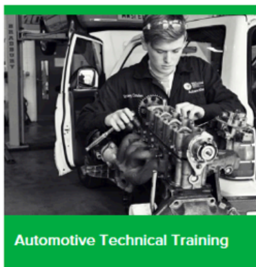
Automotive Technical Training