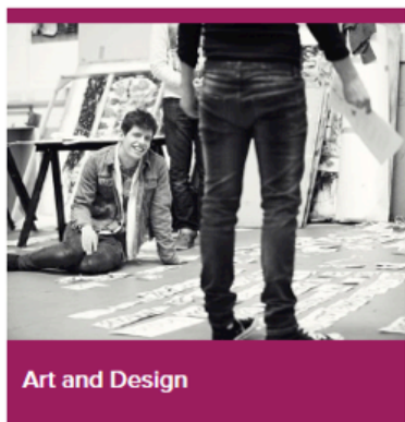
Art and Design