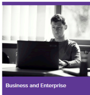
Business and Enterprise